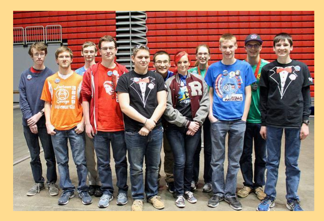
Semi-Finalists interviewed at SEMO Qualifier 2015.

Nominees must be in the 10<sup>th</sup> or 11<sup>th</sup> grade.